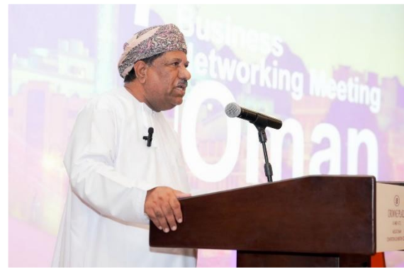
Speeches & Discussion Panel