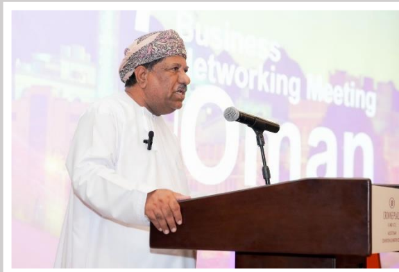
Speeches & Discussion Panel