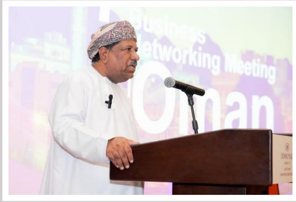
Speeches & Discussion Panel